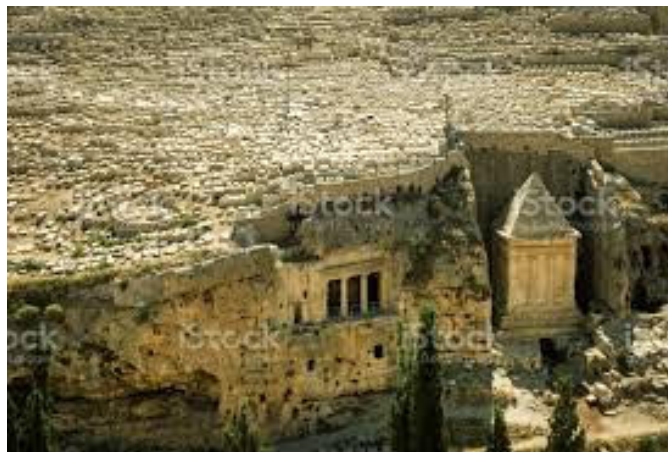
Tomb of Zechariah in Jerusalem 'carved in stone,' as are his words . . .

I have been told (to my face) that parents should have made better choices in their employment and thus their children would not have to experience this level of either poverty and hunger. This is at times accompanied by the refrain of not paying for the employment choices and / or the mistakes of other people. This is essentially a way of saying, 'feeding other people's children is not my responsibility and it certainly is not a responsibility anyone should expect from me.'