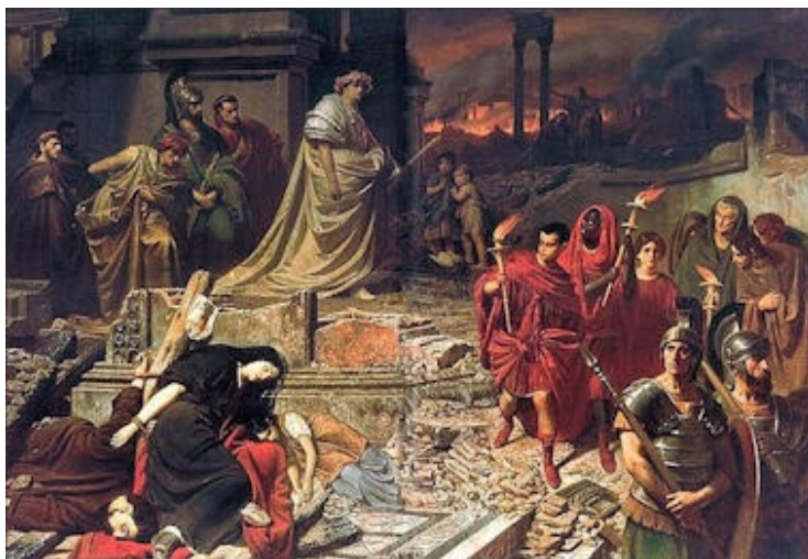
Nero Views the Burning of Rome, c. 1861 by the German Academic painter Karl von Piloty

Balshazzar throws a feast and then almost like magic, the 'writing on the wall' appears and within a day, Balshazzar's reign comes to an end. It probably shouldn't surprise us, just as we have heard of Rome's burning, so too we have heard of Nero's fiddling, and then, just like that -- that 'very day' --- begins his very end.